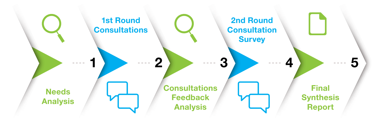
Figure 1 Suicide Prevention Competency Framework for Universities methodology

Two rounds of consultations with 11 universities and 27 participants explored and informed the domains, common and important content topics, identified gaps, and the attitudes, knowledge and skills that are required for their university.